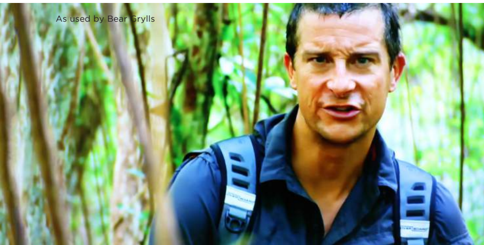
As used by Bear Grylls

Ht: 46cm / 18.1" Wt: 28cm / 11" Dpt: 24cm / 9.4" Weight: 1.21kg